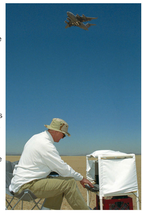
An engineering student from California Polytechnic State University at San Luis Obispo, Calif., sits on Rogers Dry Lake Bed to record the noise footprint of the C-17 Globemaster III, during a noise mitigation study being conducted by NASA.

The military incorporates the results of noise studies in its noise reduction efforts, Joint Land Use Study (JLUS) Program, and other compatible land use programs including the including the Air Installations Compatible Use Zones (AICUZ) Program, the Navy Range Air Installations Compatible Use Zones (RAICUZ) Program, and the Marine Corps Range and Compatible Use Zones ( RCUZ ) Program. These programs promote outreach between installations and local communities that will help protect public health and safety, as well as preserve the operational utility of the installation. DoD also uses the results of noise studies to identify potential REPI projects and support funding decisions that prevent incompatible development around ranges and airfields. Noise studies are also used during strategic basing decisions and National Environmental Policy Act (NEPA) analysis.